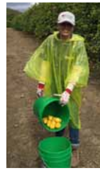
30 Human Resources employees from several regions participated in a team building activity and volunteered to glean food for the local food bank. (Oxnard, California)