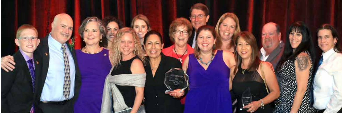
The Leukemia Lymphoma Society team (Watsonville, CA) shared the stage with family and friends to accept the "Corporate Team of the Year" award.