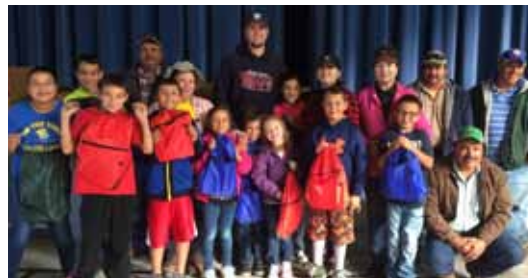
Employees distributed 750 backpacks and school supplies to 3 elementary schools during the Driscoll's of the Americas "Grow.Learn. Give" Campaign. (McArthur, California)