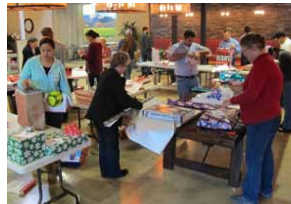
Over 360 employees participated in 8 fundraising activities during the "Winter Wishes" Campaign, including an effort that provided gifts to 600 children. (Corralitos & Watsonville, California)