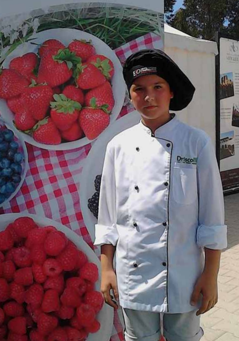
One of the 'young chefs' who participated in the cooking school organized by employees in Portugal.