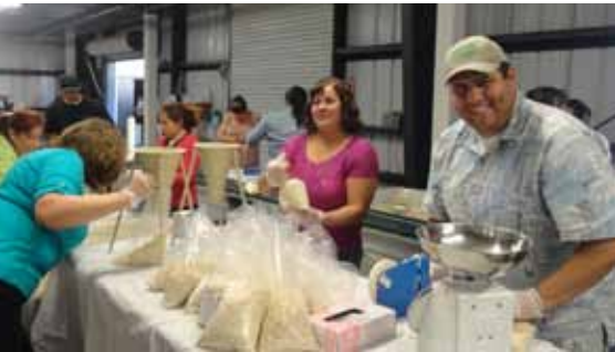
In 3 hours, Driscoll's employees and their family sorted, labelled and packed 11,300 pounds of food for the local food bank. (Santa Maria, California)