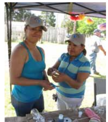
The local elementary school hosted an Earth Day EcoFair for the community thanks to the support of 26 Nursery employees and the Philanthropy team. (Red Bluff, California)