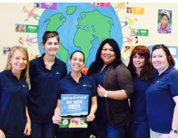
A group of Driscoll’s employees in Florida volunteered to read to students during a state-wide literacy campaign.

This past October a hands-on workshop was held at the Arturo Prat Chacón high school for the students responsible for growing blueberries on the school grounds. The workshop sought to teach the students the requirements for exporting blueberries. Specific topics covered during the event included good agricultural practices, harvest and postharvest handling, quality assurance, export documentation as well as the specific requirements of different markets.