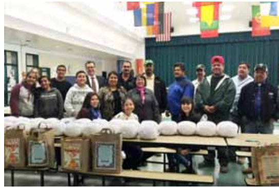
175 families received turkeys for Thanksgiving during the "Winter Wishes" Campaign thanks to the efforts of the local Philanthropy Team. (Snelling & Ballico, California)