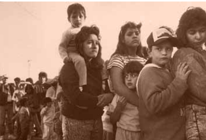
In 1989, when a 6.9 magnitude earthquake struck Santa Cruz County, the local food banks struggled to meet the needs of local residents affected by the disaster.

Driscoll's provided CAFB with grant funding and a meeting space for representatives of food banks throughout the Central Coast region to come together and formally agree on how they will help one another with food and resources in the event of a disaster.