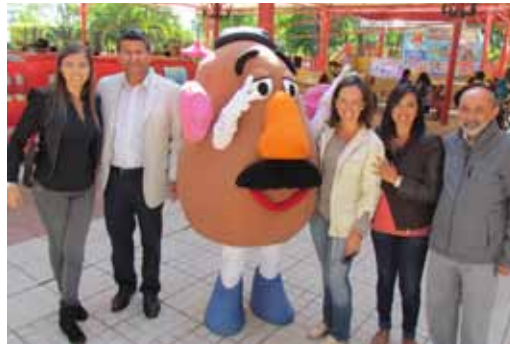
The Philanthropy Team funded employees to conduct kid friendly activities during the closing ceremony of the summer schools attended by the children of seasonal employees. (San Nicolas, Chile)