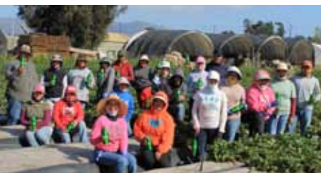
Test Plot and Breeding employees demonstrated how they conserve the planet, winning the photo contest during the Driscoll's of the Americas Earth Day Campaign. (Oxnard, California)