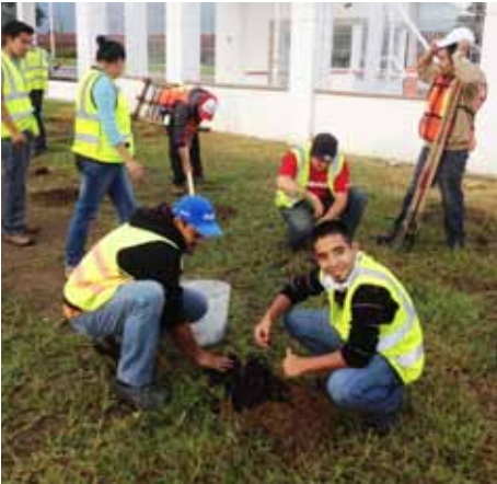
35 employees participated in a reforestation project at Driscoll's distribution center in Ciudad Guzman, Mexico.