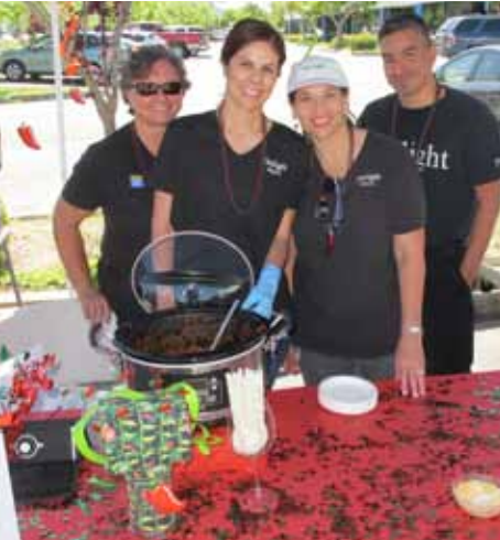
The Accounting Department was one of several groups that supported the fundraisers of the Driscoll's Leukemia Lymphoma Society Team during the Annual Chili Cook-Off. (Watsonville, California)