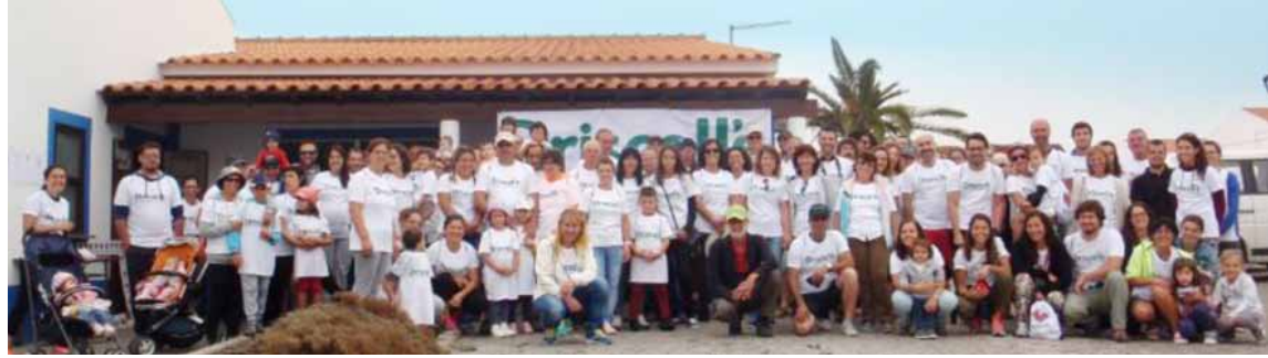
Employees hosted their first Family Day Celebration and fundraiser. Over 100 employees, family and friends helped to make the event a success. (Portugal)