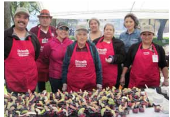
11 employees from the distribution center in Salinas, California distributed berries at the Kids Earth Day Festival hosted by the city government. (Gonzales, California, USA)