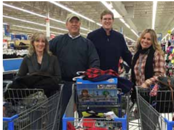
During "Winter Wishes" Campaign, Driscoll's employees collected money to buy gifts for 14 local families. They also visited 6 senior citizens, delivering gifts, home baked pastries and hand knitted hats. (Redding, California)