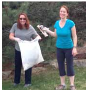
The Category Management Team collected trash to celebrate Earth Day. (Olathe, Kansas)