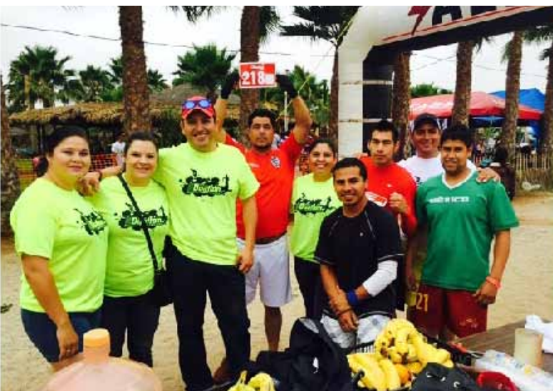
Employees in San Quintin Mexico coordinated and participated in a running & cycling competition.

This event, which raised funds for the Vicente Guerrero Volunteer Fire Department, was organized by Driscoll's employees, local youth and firefighters. BerryMex participated in the event with their 'Sembrando Salud' program, which conducts activities and presentations for both kids and adults promoting healthy eating habits.