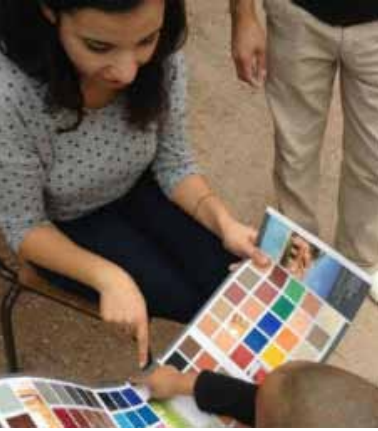
Employee in Morocco asks a child to select a color to paint the local school.