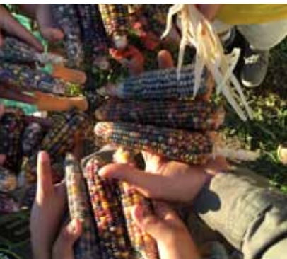
H.A. Hyde Elementary School students learn about agriculture and healthy eating in their school's garden.