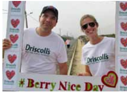
100 employees and friends participated in running and biking activities to raise money for several local charities. (Portugal)