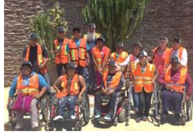
Driscoll's employees in San Quintin, Mexico welcomed disabled youth who toured the cooler and learned about the ag industry.