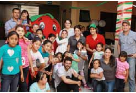
20 employees volunteered to provide school supplies, shared a meal and taught children in an orphanage how to recycle. (Guadalajara, Mexico)