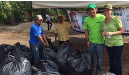
66 employees and their relatives volunteered 330 hours of their time to collect trash in several neighbourhoods. (Jocotepec, Mexico)