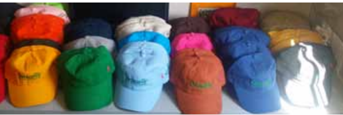
Proceeds from the hat sale benefited three employees (Los Reyes, Mexico) and their relatives affected by cancer.