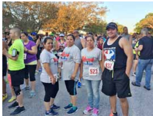
Over 20 employees, family and friends participated in the Driscoll's 34th Annual Classic Race. The event was hosted by Tampa Bay Runners and all proceeds go to two local charities. (Dover & Tampa, Florida)